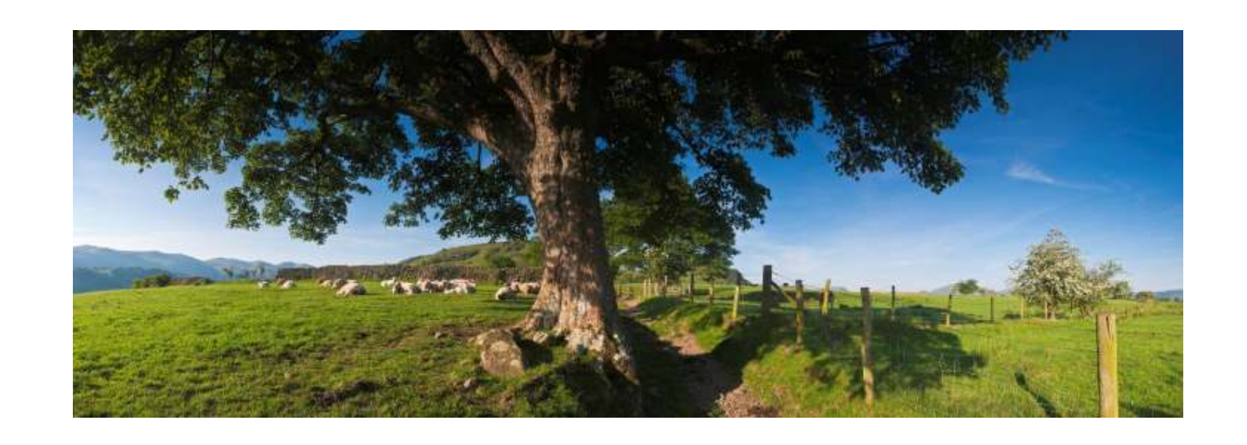
Agri- environment schemes – What's new for 2023?