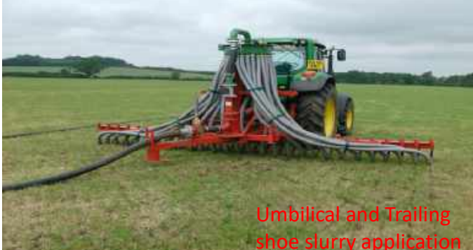
Manure storage & spreading: Nitrous Oxide: Loss when spreading Ammonia: Fertiliser 18%, Digestate sludge 5%, Sewage sludge 2%