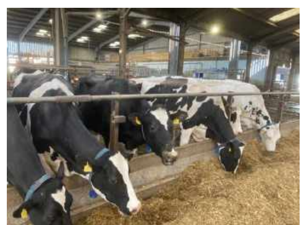
Key indicators: Urea & Milk protein