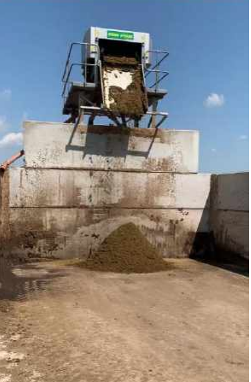
Manure management: GHG's: Manure handling 9% Ammonia: Manure stores 8%