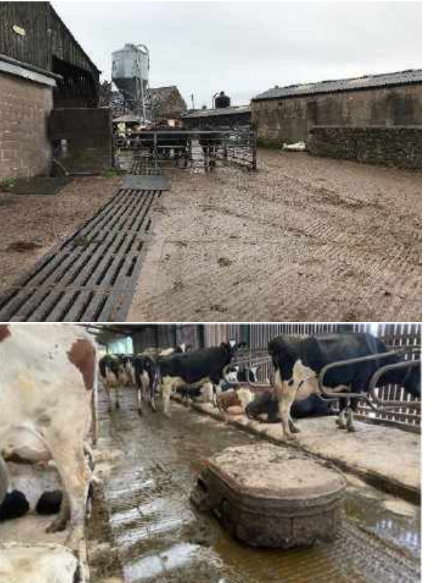
Building & Yard management & Slurry management: Ammonia: Ventilation & Hard standings 7%