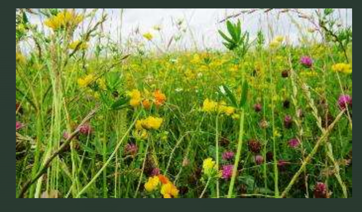
Summer 2024: restoration of species rich grassland